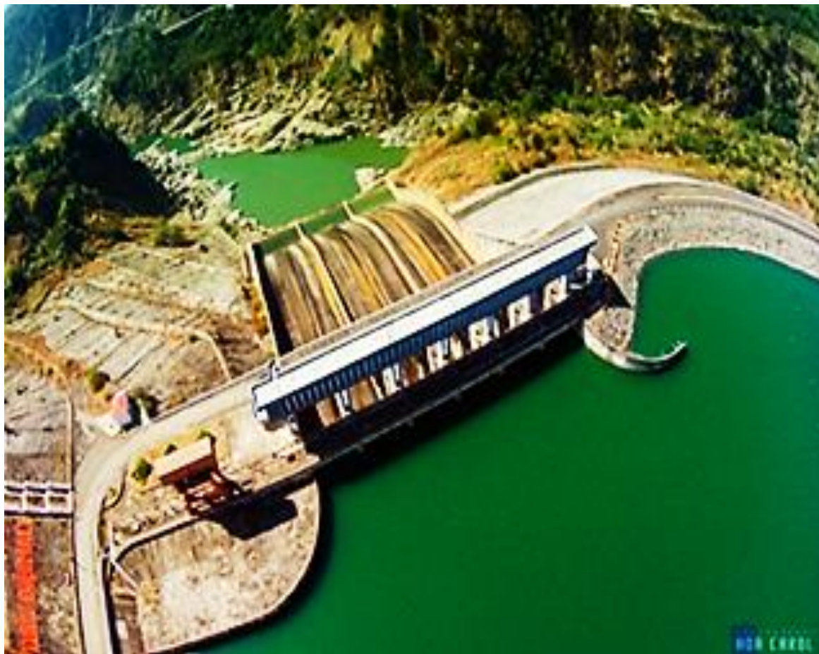
Figure 1. Hydroelectricity dam Yaly.